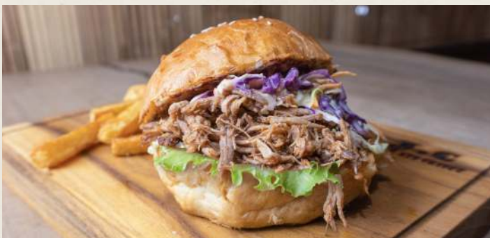
PULLED PORK 67K

2x160gr handcrafted beef patty, pork bacon, caramelised onion, melted cheese, pickle, served with french fries and choice of sauce