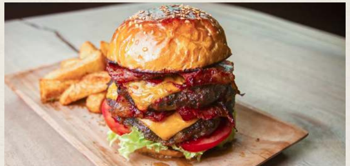
GIGA BITE 114K

160gr handcrafted beef patty, pork bacon, bratwurst, egg, onion ring, pickled jalapeno, melted cheese, served with french fries and choice of sauce