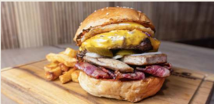
MEAT LOVER 93K

160gr handcrafted beef patty, pork bacon, caramelised onion, melted cheese, cheese sauce, pickle, served with french fries and choice of sauce