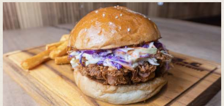
CRISPY CHICKEN 69K

Pulled pork, sauce, coleslaw, lettuce, pickle served with french fries and choice of sauce