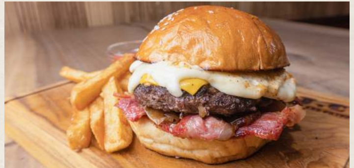
THE CHEESE BRO 77K

160gr handcrafted beef patty, onion rings, pickle, tomato, lettuce, melted cheese, thousand island sauce, served with french fries