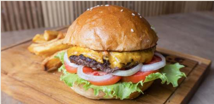
CLASSIC BEEF 71K

160gr handcrafted beef patty, onion rings, pickle, tomato, lettuce, melted cheese, thousand island sauce, served with french fries